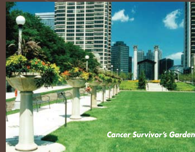
Cancer Survivor's Garden

Prefer the roar of lions and tigers to the roar of the El? Nestled just west of the Lincoln Park Zoo, the Lincoln Park Conservatory and Gardens create a peaceful and enchanting mix for your event's atmosphere. Stroll along the pathways amongst abundant vegetation, and then emerge into the expansive outdoor gardens for dinner under the stars. This versatile spot offers endless options for indoor, open-air, or tented elements at your next event.