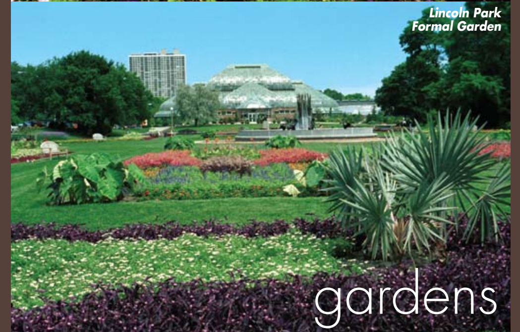
Lincoln Park Formal Garden