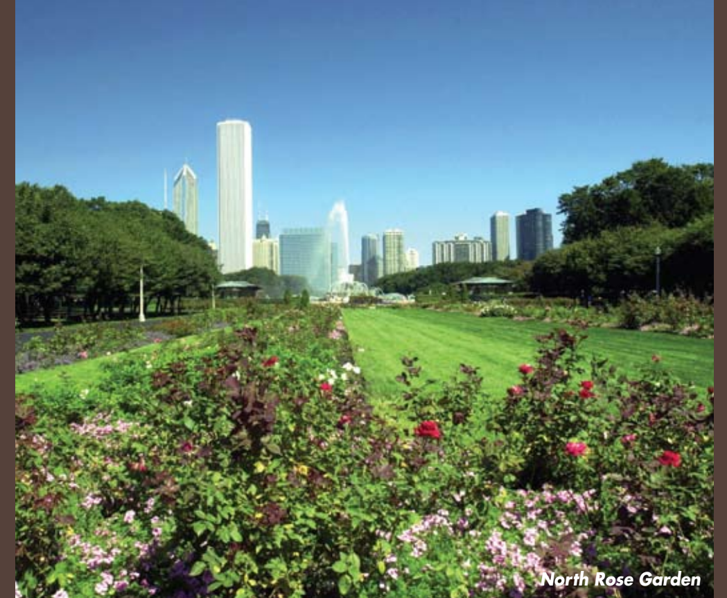
North Rose Garden